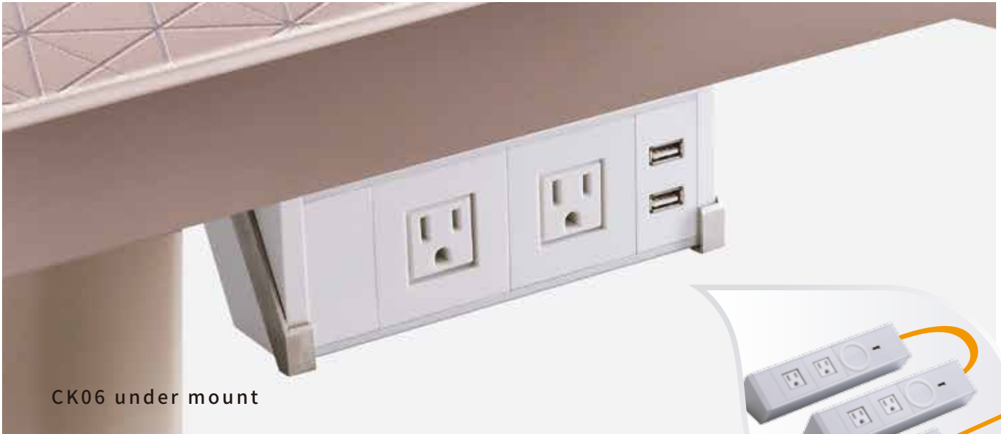
CK06 under mount