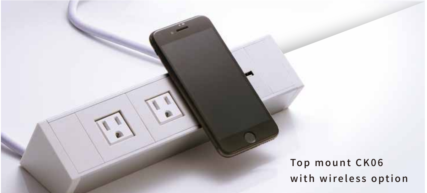
Top mount CK06 with wireless option